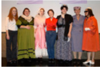
Remember the Ladies!

I am enchanted by the NMC honor students portraying first ladies in Remember the Ladies , and Benzie Women's History